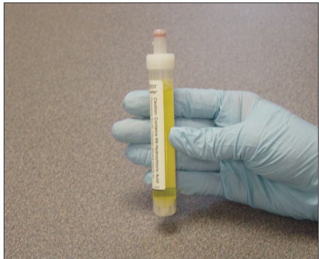
Figure 4 — Disconnecting the Multi-adapter