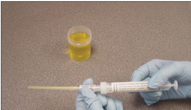
Figure 1 — Connecting the Multi-adapter

Monovette® is a registered trademark of Sarstedt Inc.