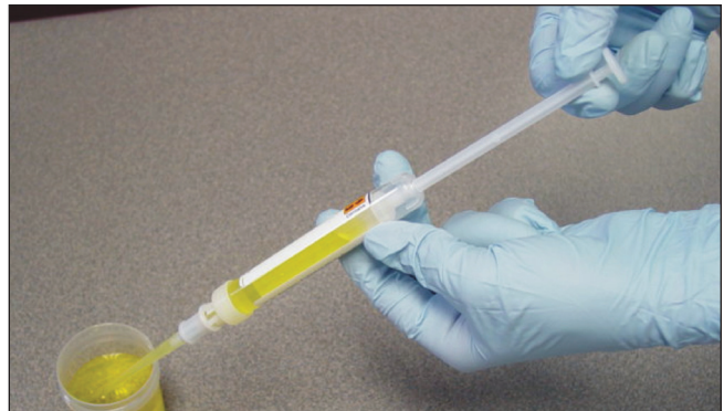
Figure 2 — Drawing Urine Into the Tube