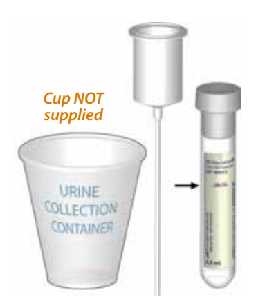
Vacutainer® Urine Culture Transport Tube