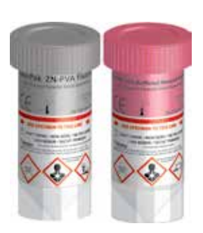
PVA and Formalin Vials