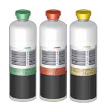
Aerobic, Anaerobic, and Pediatric BacT/Alert® Blood Culture Bottles