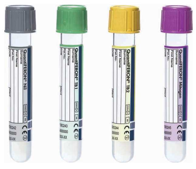
QuantiFERON®-TB Gold Plus (QFT®-Plus) Kit

Supply order numbers: 121725, 121727 (high altitude)