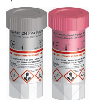
PVA and Formalin Vials